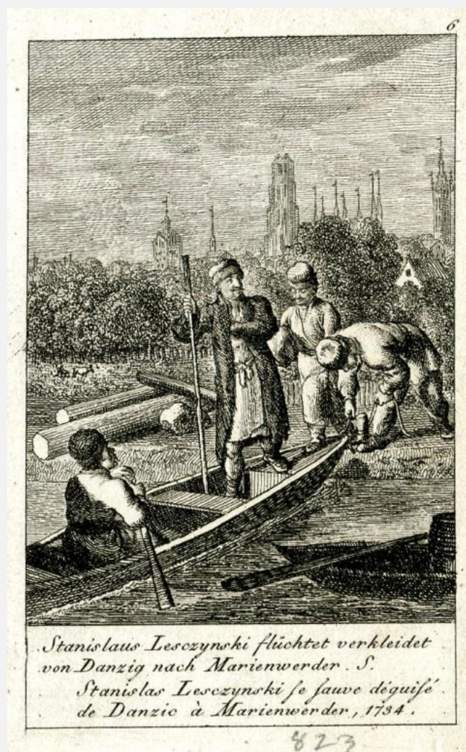
King Stanislaus I escapes from besieged Danzig in disguise

The war in Poland was over. The Russian fleet left the Gdańsk Bay and drove back to Saint Petersburg. For the adventurer Stanislaus Leszczyński, life should now be more calm. He returned to France, was formally allowed to keep the title of king and received the duchies of Lorraine and Bar for his third exile.