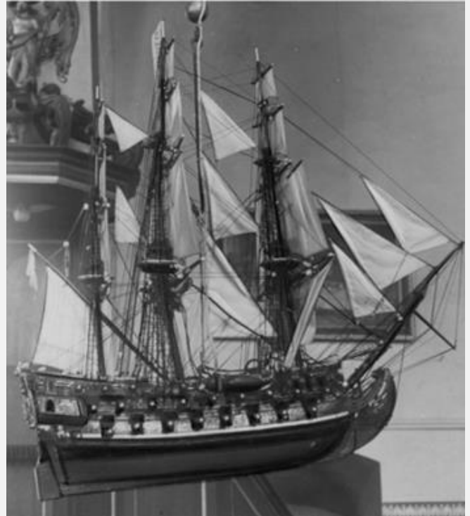
The ship model in the church (ca. 1935)

It is quite possible that parts of the settlers in Karwieńskie Błota were Calvinist religious refugees from North Frisia and Holland.