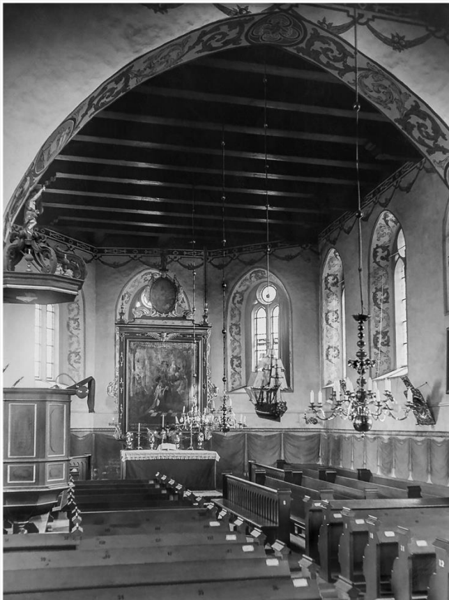
Interior of the Saint Peter and Paul Church in Hel (ca. 1935)

At the time of the War of the Polish Succession in 1733-38, there was still no noticeably developed patriotism in Europe. This was only created after the French Revolution in 1789 and the Napoleonic Wars. It remains to be seen whether Stanislaus Leszczyński can actually be called a "gambler". William Makepeace Thackeray's novel "Barry Lyndon", which was later congenially filmed by Stanley Kubrik, possibly aptly described the opportunistic mentality of the people from this era. Stanislaus Leszczyński came from a widespread Polish aristocratic family and has Lithuanian, Belarusian and German ancestors. His great-grandfather, Rafal Leszczyński (1579-1636), was a Calvinist and leader of the Reformed in Poland. The half-brother of the latter, Waclaw, was Archbishop of Gniezno and Primate of the Catholic Church in Poland. Stanislaus Leszczyński himself was probably very tolerant in religious matters, which is why he strengthened the rights of the Lutherans and the Reformed against the Catholic Church after his first election in 1704. But his reign was only five years.