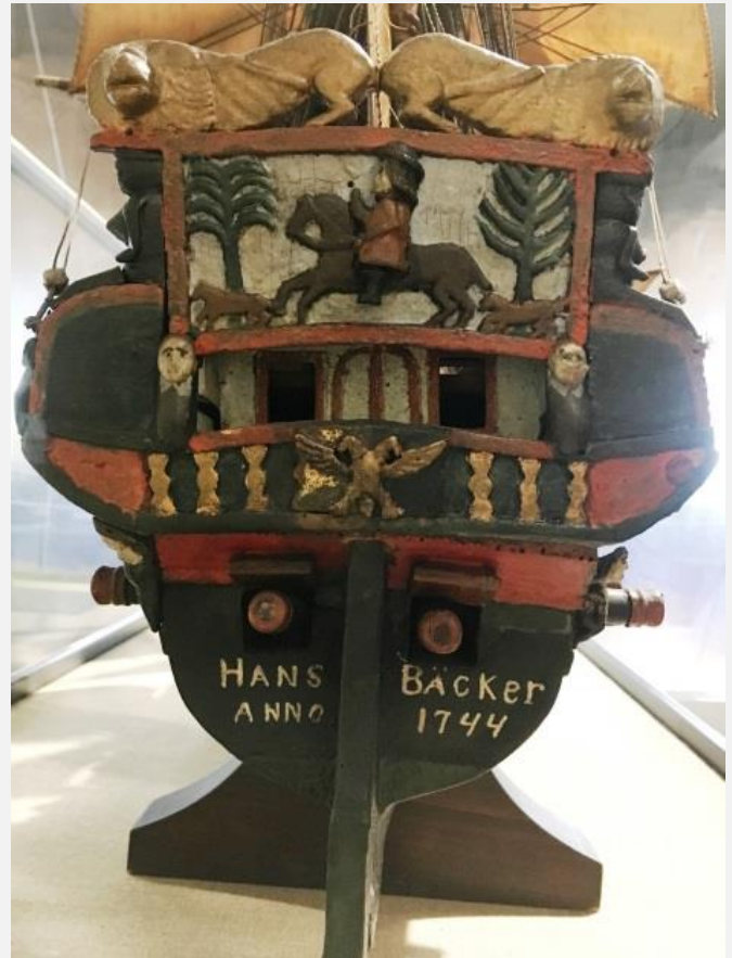
Stern of the Hel ship model of 1744 (Fishery Museum Hel)