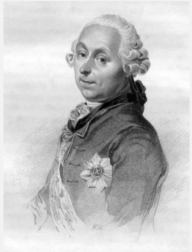
Field Marshal General Burkhard Christoph von Münnich, who is in Russian service