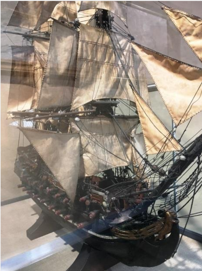
The Hel ship model of 1744 (Fishery Museum Hel)