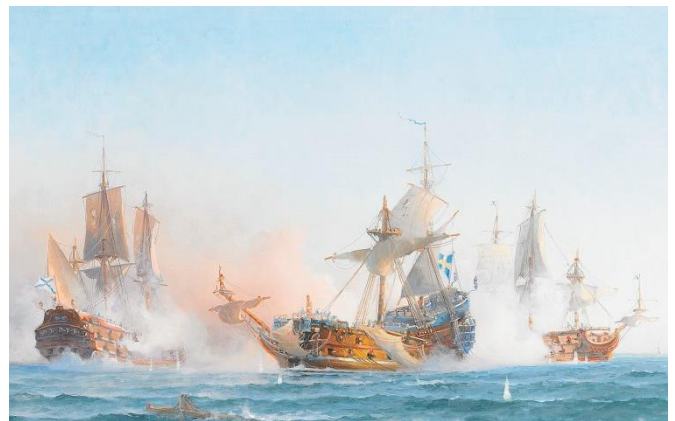
Swedish Flagship "Wachtmeister" in action against the Russian squadron in 1719 (oil painting Ludvig Richarde-Skeppet 1902, Wikimedia Commons public domain)